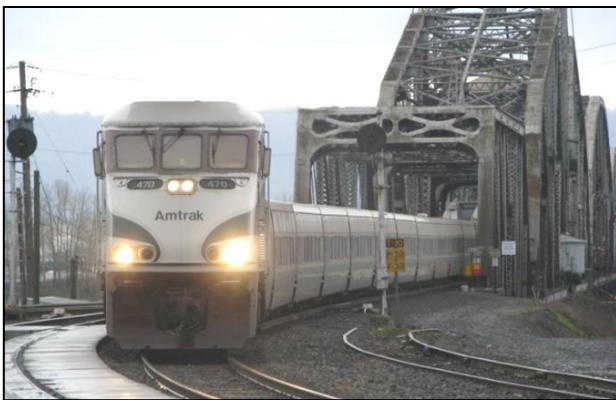
Amtrak Cascades train 506 comes off the Columbia River bridge and into the Vancouver, WA station on January 14, 2011.

The good news is that the political leadership in Washington State remains soundly committed to our state's passenger rail program. While your board at All Aboard Washington has decided with regret not to push to make the 2011-13 state budget biennium a period of aggressive growth for our trains as we had originally wanted to, we will still press for improvements in the Legislature that will produce results without costing much. One key area will be bank stabilization...and we're not talking about the type that makes loans. You probably have heard a number of times now about continuing Sounder and Amtrak train cancellations due to another mudslide in our region, usually north of Seattle. Every time one of these happens, hundreds of millions of dollars in state investment in passenger rail is lost. (See Priorities , page 4)