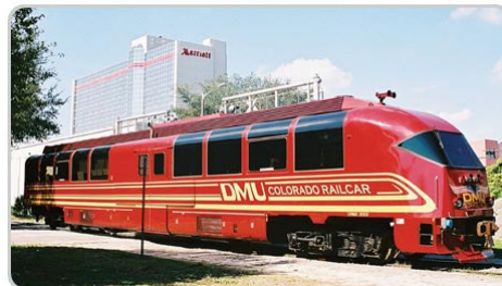
Colorado Railcar's single level DMU.

Still, Sound Transit has cushioned its initial over-investment in equipment by leasing some of it to transit agencies elsewhere, the Sounder Tacoma service is thriving, and additional frequencies be-